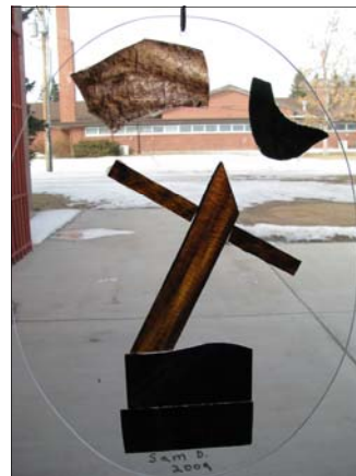
One of the children's Sun-catchers