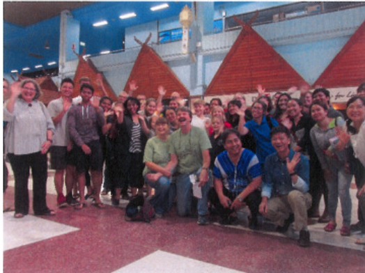
Farewell at the airport