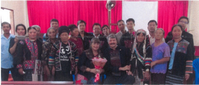
Our good friends in Sukkasem Village