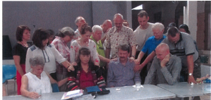
Prayers for our transition