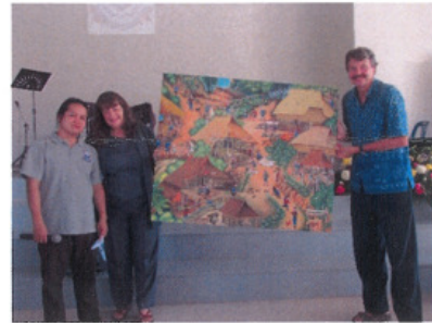
A painting of an Akha village