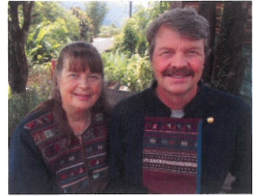
Our new jackets!