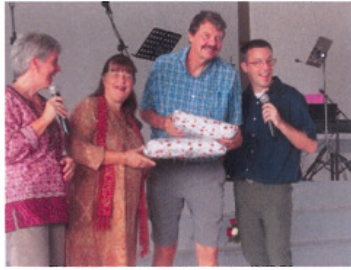
CRICS says "thank-you"